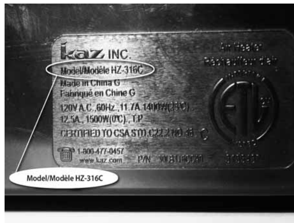
Rating Label on the back of the unit. Model number should be Model/Modèle HZ-316C